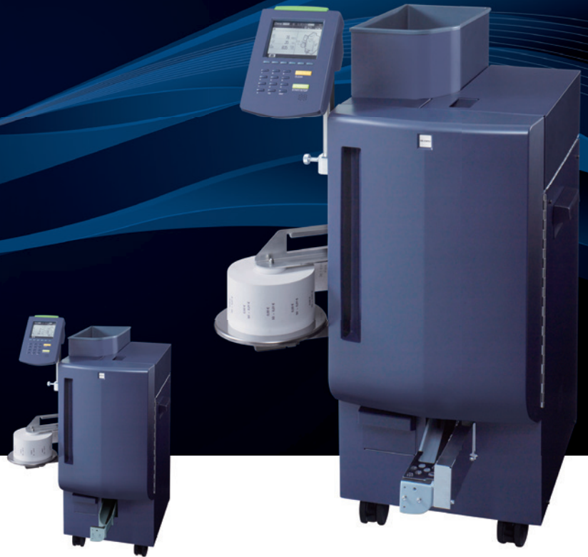
WR-90 Standard model